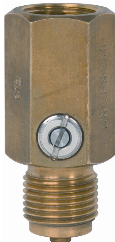
Pressure gauge snubber, Model 910.12